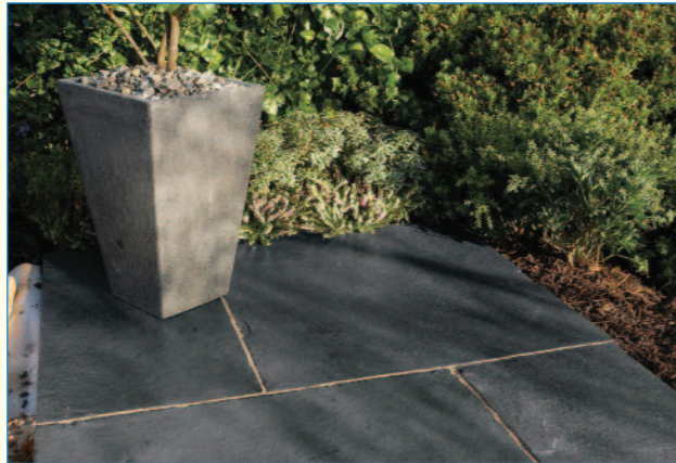
B Natural Limestone Hand cut and subtly riven with softer edges than it's machine cut counterparts. Available as a 15.3m 2 feature kit in three colourways. Pictured: Blue-Black