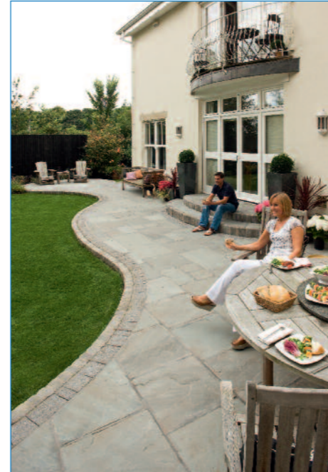
M Fairstone® Riven Specially graded riven sandstone with timeless appeal. Available as a 16m 2 project pack in Silver Birch Multi, Autumn Bronze Multi and Golden Sand Multi Pictured: Silver Birch Multi with Autumn Bronze Multi Split Setts and Drivesett Argent Light soldier course