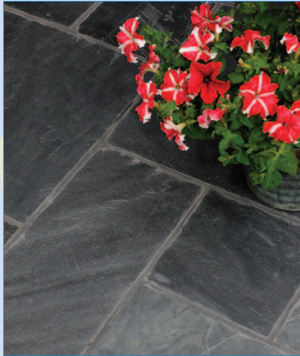
Br Slate Carefully selected at the quarry for a smooth characterful surface, slate is available as a 15.24m 2 mixed size project pack or circles in a choice of Oyster Shell or Olive Black. Pictured: Olive Black