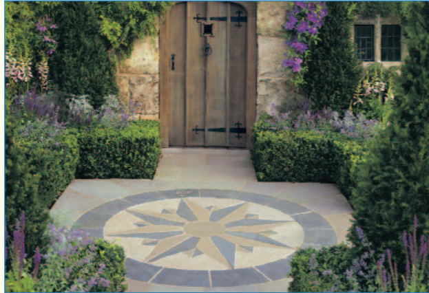
S Vintage Stone Manor A fully integrated collection of sandstone paving, walling and setts. Compass Points is meticulously cut from three colours of stone and has an intricate brass inlay to mark 'North' Pictured: Compass Points with Manor paving